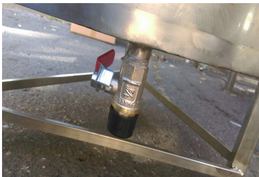
Filler valve and water drain valve from the water jacket

CAUTION: The heater should not work without liquid in the system. During operation without liquid it may be destroyed. Water should be poured only through the lower valve!